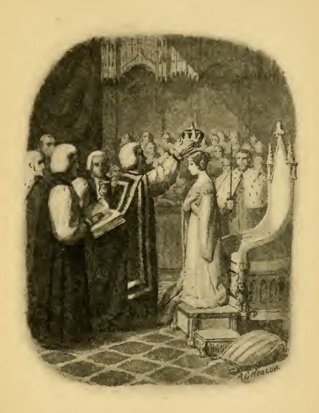
"And she was anointed with oil and was crowned Queen, and the people of Anglo-Israel cried with a loud voice: "'Gon SAVE THE QUEEN!'"