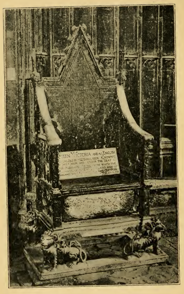
The Coronation Chair. "Behold the 'Lia Phael'!" Frontispiece.