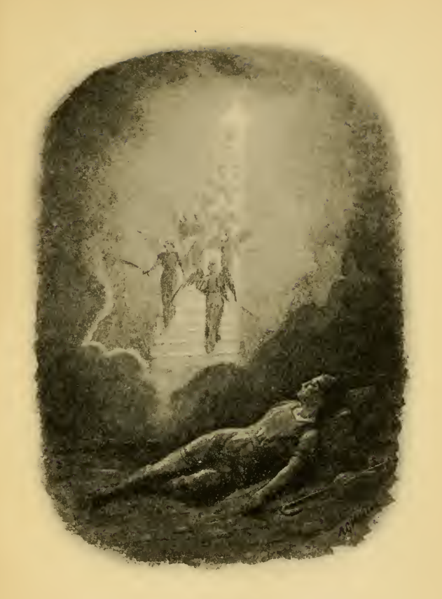
"As the dust of the earth, As the stars of the heavens innumerable, As the sands upon the sea-shore Which no man may number."